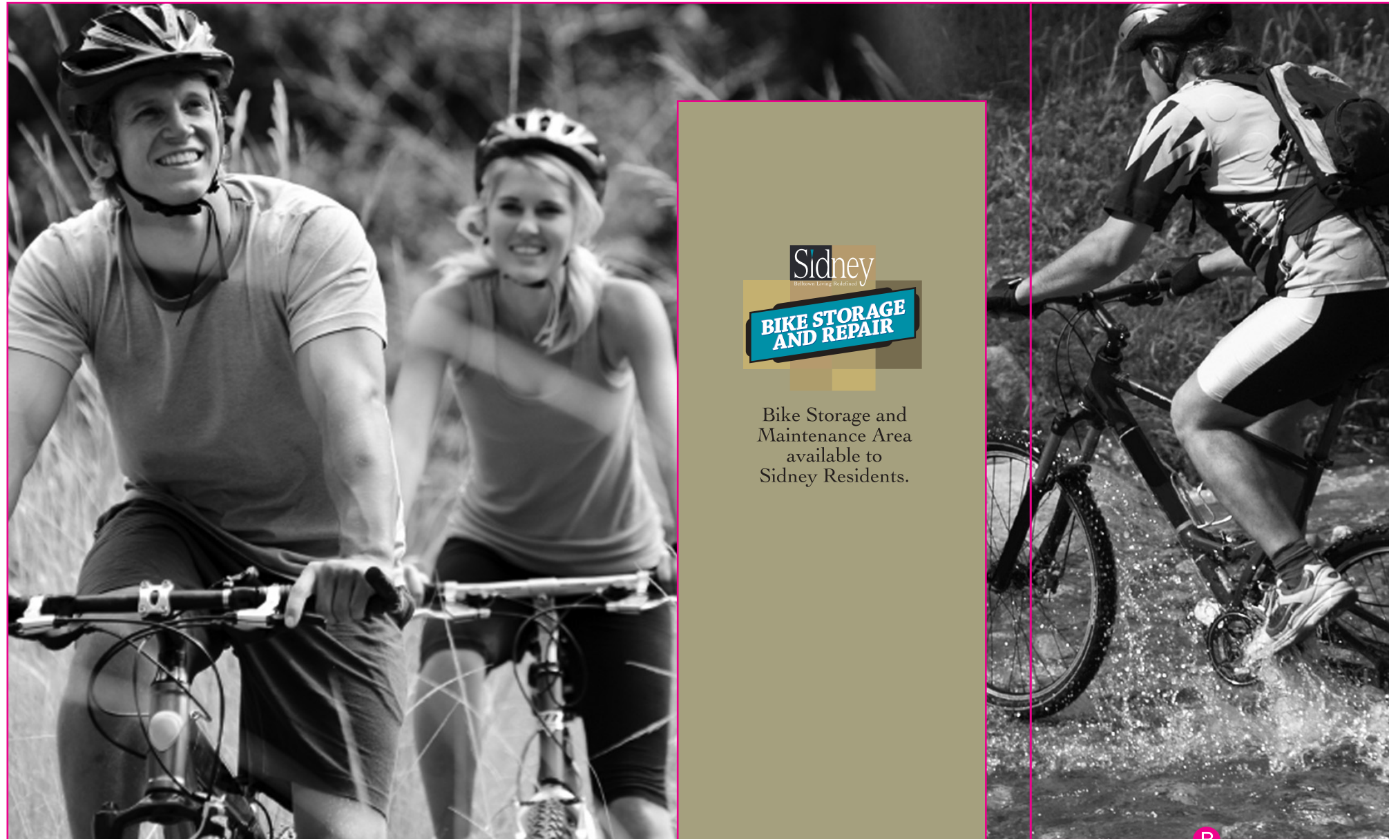
Image wraps around the 2 walls and cut away from door. Separate pieces on door