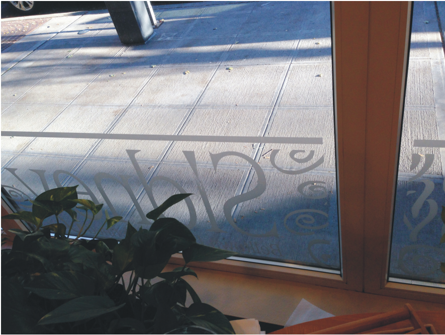
Frosted matte vinyl on inside of glass