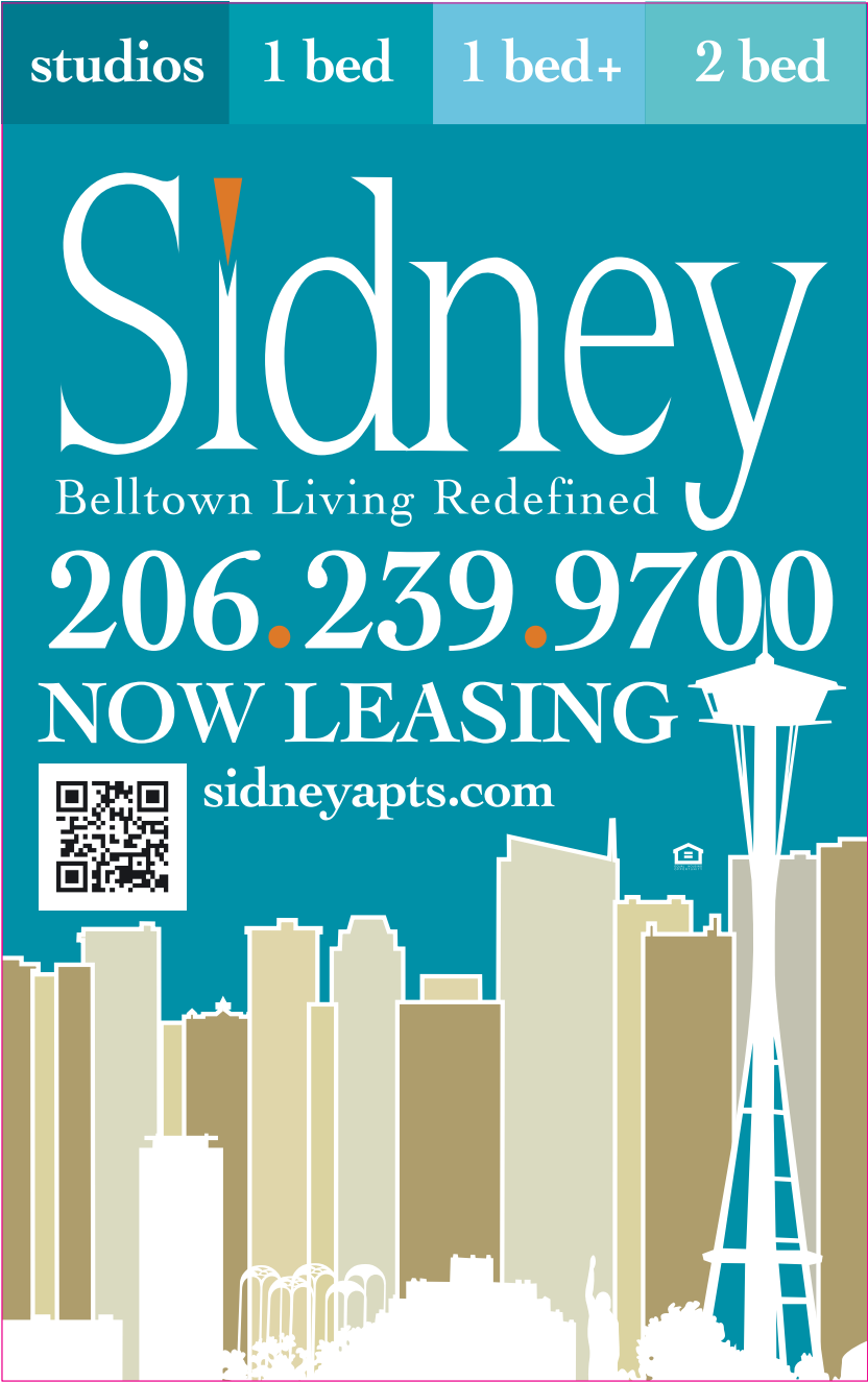
27" w x 43" t